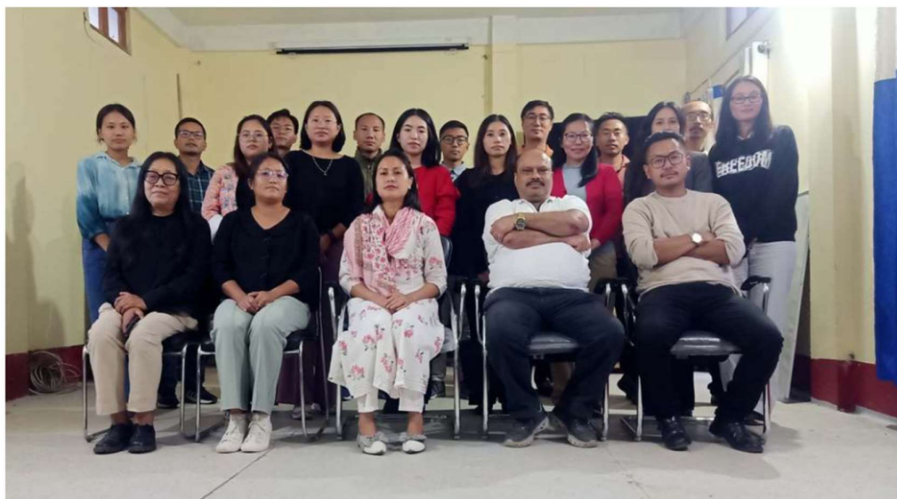
Faculty and students of Sao Chang College pose for a photograph during an inter-departmental seminar on Friday.

DIMAPUR — The Research Committee, in collaboration with the Alumni Association of Sao Chang College, successfully conducted an inter-departmental seminar on Friday through a hybrid mode.